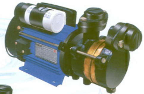
Magic Suction 1.0 H.P.