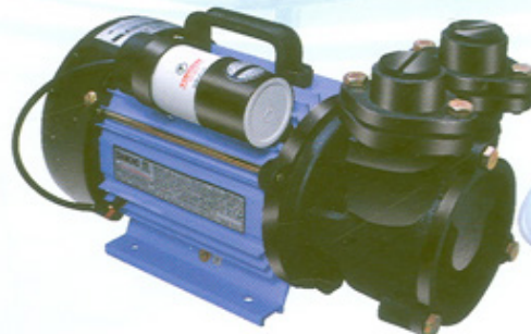
Speedy Suction 1.0 H.P.