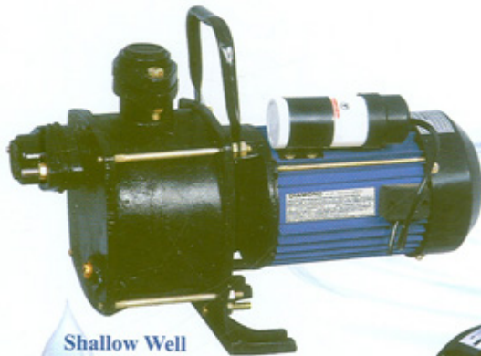
Shallow Well Pump