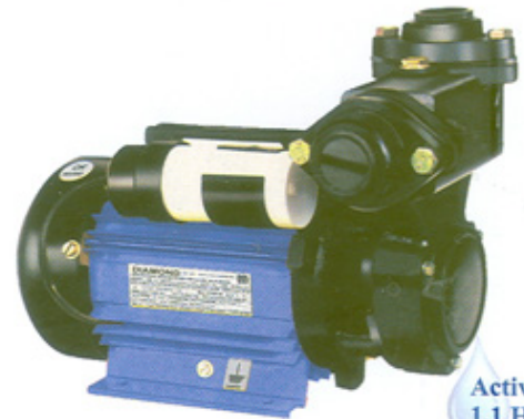
Activa 1.1 H.P.