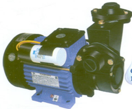
Crystal 1.0 H.P.